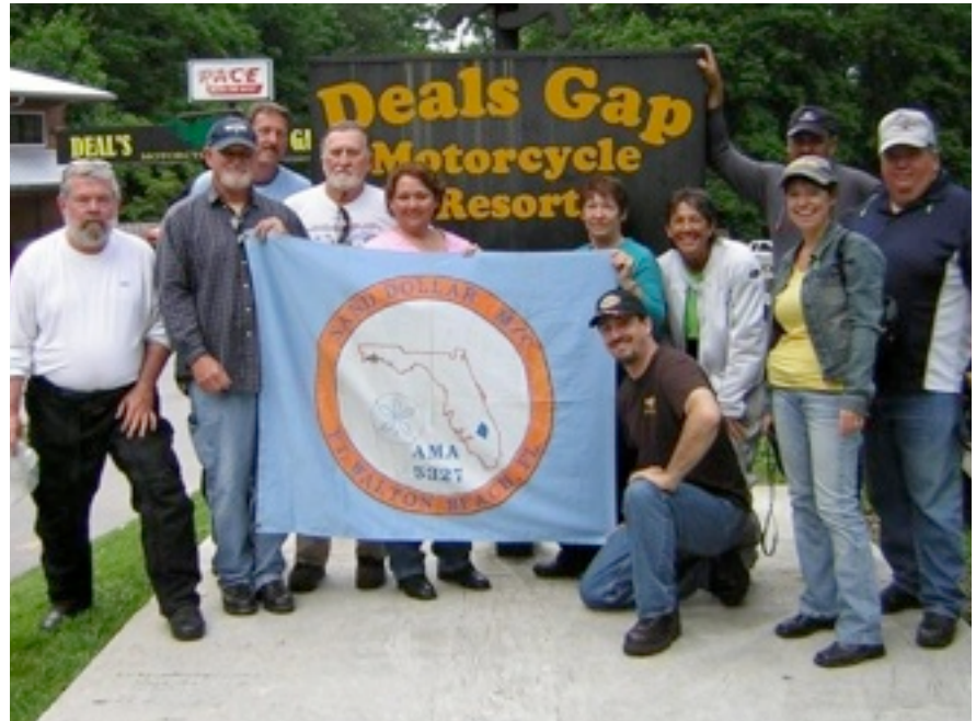
Here we stand proud holding our short banner eleven Sandies.