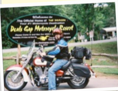
Here I sit proud and tall on iron steed. I slayed the Dragon once again at Deals Gap.

My new J&M CB worked like a charm and it was a very different experience being able to know what is going on. Nice to know that everyone has made it thru a turn or some bit of a group has stopped at a light. I also liked being able to have my music on board piped thru the CB. Although is a little annoying when a favorite piece of your music comes on and there is a lot of chit chat so, it is a mixed experience having a CB.